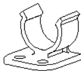
Mounting Clip (2 included per light) C780-0040